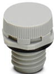
Pressure compensation element, Cable gland material: Polyamide, Polyamide, Connecting thread: M12, Color: light gray

Please be informed that the data shown in this PDF Document is generated from our Online Catalog. Please find the complete data in the user's documentation. Our General Terms of Use for Downloads are valid ( http://phoenixcontact.com/download )