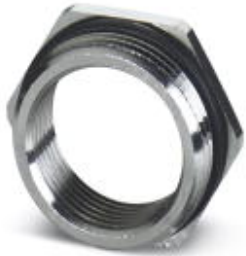
Reducing adapter, Nickel-plated brass, Connecting thread: Pg29

Please be informed that the data shown in this PDF Document is generated from our Online Catalog. Please find the complete data in the user's documentation. Our General Terms of Use for Downloads are valid ( http://phoenixcontact.com/download )