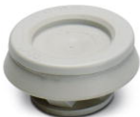
Membrane screw connection, Cable gland material: Polypropylene, Application: Standard, External cable diameter 6 mm ... 13 mm, Shielding: No, Connecting thread: M20, Color: lightgrey RAL 7035

Please be informed that the data shown in this PDF Document is generated from our Online Catalog. Please find the complete data in the user's documentation. Our General Terms of Use for Downloads are valid ( http://phoenixcontact.com/download )