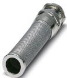
Cable gland, Cable gland material: Nickel-plated brass, Application: Standard, External cable diameter 16 mm ... 28 mm, Shielding: No, Connecting thread: M40, Color: silver

Please be informed that the data shown in this PDF Document is generated from our Online Catalog. Please find the complete data in the user's documentation. Our General Terms of Use for Downloads are valid ( http://phoenixcontact.com/download )