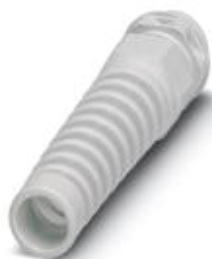
Cable gland, Cable gland material: Polyamide, Application: Standard, External cable diameter 3 mm ... 7 mm, Shielding: No, Connecting thread: M12, Color: lightgrey RAL 7035

Please be informed that the data shown in this PDF Document is generated from our Online Catalog. Please find the complete data in the user's documentation. Our General Terms of Use for Downloads are valid ( http://phoenixcontact.com/download )