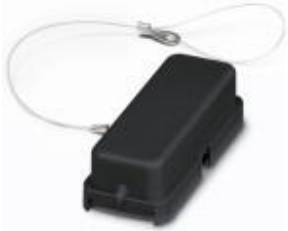
HEAVYCON protective cover D15, for HC-EVO-D15... supporting base element, for single locking latch, with retaining cord with combination eyelet, IP54, PA

Please be informed that the data shown in this PDF Document is generated from our Online Catalog. Please find the complete data in the user's documentation. Our General Terms of Use for Downloads are valid ( http://phoenixcontact.com/download )