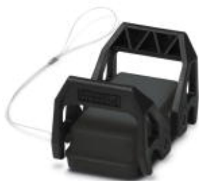
HEAVYCON protective cover, B10, for HC-EVO-B10... sleeve housing, with double locking latch, with retaining cord, IP54

Please be informed that the data shown in this PDF Document is generated from our Online Catalog. Please find the complete data in the user's documentation. Our General Terms of Use for Downloads are valid ( http://phoenixcontact.com/download )