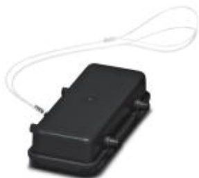
HEAVYCON protective cord, B16, for HC-EVO-B16... sleeve housing, for double locking latch, with retaining cord, IP54, with seal

Please be informed that the data shown in this PDF Document is generated from our Online Catalog. Please find the complete data in the user's documentation. Our General Terms of Use for Downloads are valid ( http://phoenixcontact.com/download )