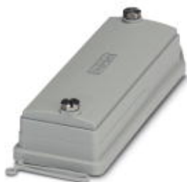
HEAVYCON ADVANCE, IP66, B24 protective cover for panel mounting side, with screw locking, with retaining cord, diameter of retaining cord eyelet: 3 mm

Please be informed that the data shown in this PDF Document is generated from our Online Catalog. Please find the complete data in the user's documentation. Our General Terms of Use for Downloads are valid ( http://phoenixcontact.com/download )