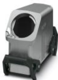
HEAVYCON EVO coupling housing, EMC version, without powder coating, with bayonet flange for EVO screw connection, B24, with double locking latch, height: 90 mm, without EVO screw connection.

Please be informed that the data shown in this PDF Document is generated from our Online Catalog. Please find the complete data in the user's documentation. Our General Terms of Use for Downloads are valid ( http://phoenixcontact.com/download )