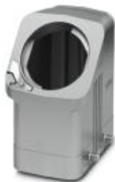
HEAVYCON EVO sleeve housing, EMC version, without powder coating, with bayonet flange for EVO screw connection, B16, for double locking latch, height: 88 mm, without EVO screw connection.

Please be informed that the data shown in this PDF Document is generated from our Online Catalog. Please find the complete data in the user's documentation. Our General Terms of Use for Downloads are valid ( http://phoenixcontact.com/download )