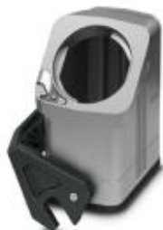
HEAVYCON EVO coupling housing, EMC version, without powder coating, with bayonet flange for EVO screw connection, B10, with single locking latch, height: 83 mm, without EVO screw connection.

Please be informed that the data shown in this PDF Document is generated from our Online Catalog. Please find the complete data in the user's documentation. Our General Terms of Use for Downloads are valid ( http://phoenixcontact.com/download )