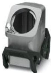
HEAVYCON EVO sleeve housing, EMC version, without powder coating, with bayonet flange for EVO screw connection, B10, with double locking latch, height: 80 mm, without EVO screw connection.

Please be informed that the data shown in this PDF Document is generated from our Online Catalog. Please find the complete data in the user's documentation. Our General Terms of Use for Downloads are valid ( http://phoenixcontact.com/download )