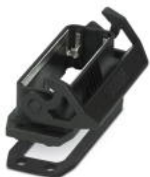
HEAVYCON EVO panel mounting base, plastic, D25, with single locking latch and flat gasket

Please be informed that the data shown in this PDF Document is generated from our Online Catalog. Please find the complete data in the user's documentation. Our General Terms of Use for Downloads are valid ( http://phoenixcontact.com/download )