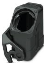
HEAVYCON EVO coupling housing, plastic, with bayonet flange for EVO screw connection, D15, with single locking latch, without EVO screw connection

Please be informed that the data shown in this PDF Document is generated from our Online Catalog. Please find the complete data in the user's documentation. Our General Terms of Use for Downloads are valid ( http://phoenixcontact.com/download )