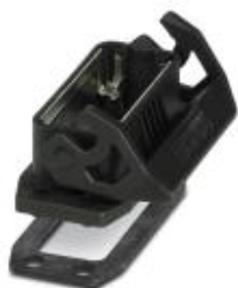
HEAVYCON EVO panel mounting base, plastic, D15, with single locking latch, with flat gasket

Please be informed that the data shown in this PDF Document is generated from our Online Catalog. Please find the complete data in the user's documentation. Our General Terms of Use for Downloads are valid ( http://phoenixcontact.com/download )