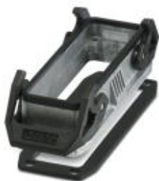
HEAVYCON B24 panel mounting base, with double locking latch, with flat gasket, salt-water-resistant aluminum, conductive profile gasket

Please be informed that the data shown in this PDF Document is generated from our Online Catalog. Please find the complete data in the user's documentation. Our General Terms of Use for Downloads are valid ( http://phoenixcontact.com/download )