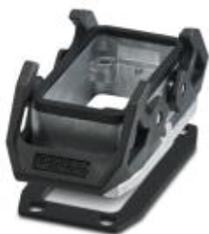
HEAVYCON B10 panel mounting base, with double locking latch, with flat gasket, salt-water-resistant aluminum, conductive profile gasket

Please be informed that the data shown in this PDF Document is generated from our Online Catalog. Please find the complete data in the user's documentation. Our General Terms of Use for Downloads are valid ( http://phoenixcontact.com/download )