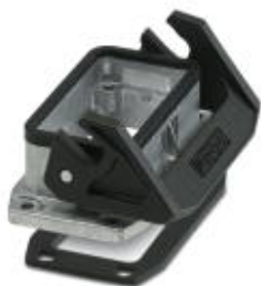
HEAVYCON panel mounting base, B10, with single locking latch, with flat gasket, salt-water-resistant aluminum, conductive profile gasket

Please be informed that the data shown in this PDF Document is generated from our Online Catalog. Please find the complete data in the user's documentation. Our General Terms of Use for Downloads are valid ( http://phoenixcontact.com/download )