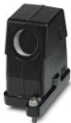
HEAVYCON B6 sleeve housing, HPR series, with screw locking, with M25 thread, lateral outlet, for increased environmental and EMC requirements

Please be informed that the data shown in this PDF Document is generated from our Online Catalog. Please find the complete data in the user's documentation. Our General Terms of Use for Downloads are valid ( http://phoenixcontact.com/download )