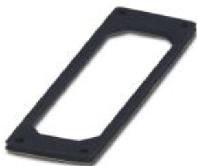
Flange seal, for HEAVYCON type B24 panel mounting base, self-adhesive, foam rubber made from cellular rubber, color: black

Please be informed that the data shown in this PDF Document is generated from our Online Catalog. Please find the complete data in the user's documentation. Our General Terms of Use for Downloads are valid ( http://phoenixcontact.com/download )