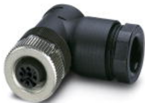
Connector, 4-position, Socket angled M12, A-coded, Screw connection, Knurl material: Zinc die-cast, nickel-plated, Cable gland Pg11, External cable diameter 8 mm ... 10 mm

Please be informed that the data shown in this PDF Document is generated from our Online Catalog. Please find the complete data in the user's documentation. Our General Terms of Use for Downloads are valid ( http://phoenixcontact.com/download )