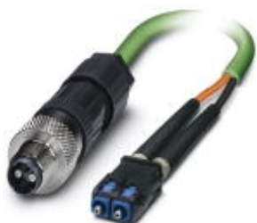
Assembled FO cable, round cable, 980/1000 µm POF fiber, M12 fiber optic connector to SC-RJ/IP20

Please be informed that the data shown in this PDF Document is generated from our Online Catalog. Please find the complete data in the user's documentation. Our General Terms of Use for Downloads are valid ( http://phoenixcontact.com/download )