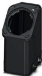
HEAVYCON EVO sleeve housing, plastic, with bayonet flange for EVO screw connection, B10, for double locking latch, height: 87.5 mm, without EVO screw connection

Please be informed that the data shown in this PDF Document is generated from our Online Catalog. Please find the complete data in the user's documentation. Our General Terms of Use for Downloads are valid ( http://phoenixcontact.com/download )