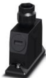
HEAVYCON ADVANCE B24 sleeve housing, with screw locking (Allen screw), plastic, height: 100 mm, with 1 x M40 thread, straight cable outlet

Please be informed that the data shown in this PDF Document is generated from our Online Catalog. Please find the complete data in the user's documentation. Our General Terms of Use for Downloads are valid ( http://phoenixcontact.com/download )