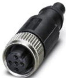
PROFIBUS M12 termination resistor, female connector version

Please be informed that the data shown in this PDF Document is generated from our Online Catalog. Please find the complete data in the user's documentation. Our General Terms of Use for Downloads are valid ( http://phoenixcontact.com/download )