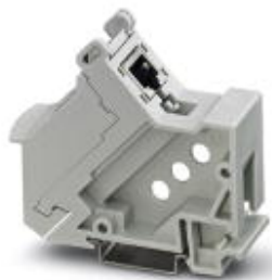
Patch panel, RJ45, DIN rail mounting, IP20, 1 slot, IDC connection, CAT6 A

Please be informed that the data shown in this PDF Document is generated from our Online Catalog. Please find the complete data in the user's documentation. Our General Terms of Use for Downloads are valid ( http://phoenixcontact.com/download )