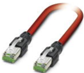
Sercos III patch cable, shielded, star quad, AWG 22 stranded (7-wire), RAL 3020 (traffic red), RJ45 plug/IP 20, straight, to RJ45 plug/IP20, straight, length: 1.0 m

Please be informed that the data shown in this PDF Document is generated from our Online Catalog. Please find the complete data in the user's documentation. Our General Terms of Use for Downloads are valid ( http://phoenixcontact.com/download )