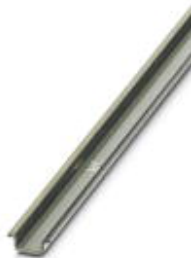
DIN rail, material: Steel, unperforated, height 5.5 mm, width 15 mm, length: 2 m

Please be informed that the data shown in this PDF Document is generated from our Online Catalog. Please find the complete data in the user's documentation. Our General Terms of Use for Downloads are valid ( http://phoenixcontact.com/download )