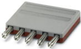
The illustration shows test plugs SPB 5-MKDS 3 and SPB 5-GMKDS 3