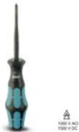
Screwdriver, crosshead PZ (lasered), insulated, size: PZ 1 x 80, 2-component handle, with non-slip grip

Please be informed that the data shown in this PDF Document is generated from our Online Catalog. Please find the complete data in the user's documentation. Our General Terms of Use for Downloads are valid ( http://phoenixcontact.com/download )