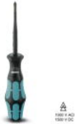
Screwdriver, crosshead PH (lasered), insulated, size: PH 1 x 80, 2-component handle, with non-slip grip

Please be informed that the data shown in this PDF Document is generated from our Online Catalog. Please find the complete data in the user's documentation. Our General Terms of Use for Downloads are valid ( http://phoenixcontact.com/download )