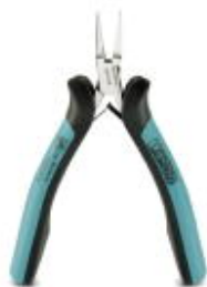
Electronic flat pliers, smooth gripping surface, with spring opening

Please be informed that the data shown in this PDF Document is generated from our Online Catalog. Please find the complete data in the user's documentation. Our General Terms of Use for Downloads are valid ( http://phoenixcontact.com/download )