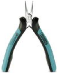
Electronic needle-nose pliers, smooth grip, with opening spring

Please be informed that the data shown in this PDF Document is generated from our Online Catalog. Please find the complete data in the user's documentation. Our General Terms of Use for Downloads are valid ( http://phoenixcontact.com/download )