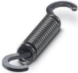
Spare recuperating spring

Please be informed that the data shown in this PDF Document is generated from our Online Catalog. Please find the complete data in the user's documentation. Our General Terms of Use for Downloads are valid ( http://phoenixcontact.com/download )