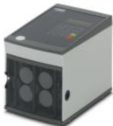
Cutting machine, for cables, litz wires, and shrink sleeves, 230 V mains voltage

Please be informed that the data shown in this PDF Document is generated from our Online Catalog. Please find the complete data in the user's documentation. Our General Terms of Use for Downloads are valid ( http://phoenixcontact.com/download )