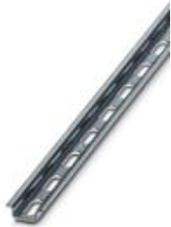
DIN rail, material: steel, perforated, height 5.5 mm, width 15 mm, length: 2 m

Please be informed that the data shown in this PDF Document is generated from our Online Catalog. Please find the complete data in the user's documentation. Our General Terms of Use for Downloads are valid ( http://phoenixcontact.com/download )