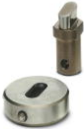
Stamping bit, for elongated holes: 4.5 x 12 mm

Please be informed that the data shown in this PDF Document is generated from our Online Catalog. Please find the complete data in the user's documentation. Our General Terms of Use for Downloads are valid ( http://phoenixcontact.com/download )