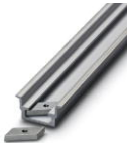
Slide nut, for DIN rail NS 35/15-AL, with M 6 thread, for mounting equipment, material: Steel

Please be informed that the data shown in this PDF Document is generated from our Online Catalog. Please find the complete data in the user's documentation. Our General Terms of Use for Downloads are valid ( http://phoenixcontact.com/download )