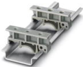
Rail adapters, for M3 screws, Length: 42.6 mm, Width: 10 mm, Height: 19 mm, Color: gray

Please be informed that the data shown in this PDF Document is generated from our Online Catalog. Please find the complete data in the user's documentation. Our General Terms of Use for Downloads are valid ( http://phoenixcontact.com/download )