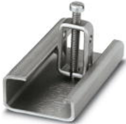
End clamp, width: 8 mm

Please be informed that the data shown in this PDF Document is generated from our Online Catalog. Please find the complete data in the user's documentation. Our General Terms of Use for Downloads are valid ( http://phoenixcontact.com/download )