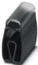
Wire marker carrier, transparent/black, unmarked, mounting type: slid on, cable diameter: 5 - 10 mm, lettering field size: 4 x 12 mm

Please be informed that the data shown in this PDF Document is generated from our Online Catalog. Please find the complete data in the user's documentation. Our General Terms of Use for Downloads are valid ( http://phoenixcontact.com/download )