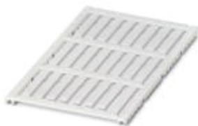
The figure shows the white version

Marker for end clamp, Sheet, yellow, unlabeled, can be labeled with: THERMOMARK CARD, BLUEMARK CLED, BLUEMARK LED, TOPMARK LASER, Mounting type: snapped into marker carrier, Lettering field: 30 x 5 mm