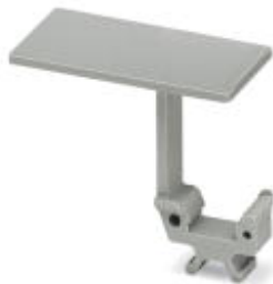
Group marking label, snaps into terminal center for push-in terminal blocks ...1.5/S, Lettering field 25 x 12 mm, pitch 3.5 mm, labeled with EML (25.4 x 12.7)R

Please be informed that the data shown in this PDF Document is generated from our Online Catalog. Please find the complete data in the user's documentation. Our General Terms of Use for Downloads are valid ( http://phoenixcontact.com/download )