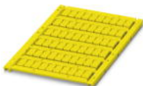
The figure shows the UCT-TM 6 version

Marker for terminal blocks, can be ordered: by sheet, yellow, labeled according to customer specifications, Mounting type: Snap into tall marker groove, for terminal block width: 6.2 mm, Lettering field: 5.55 x 10 mm