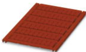
The figure shows the UCT-TM 6

Marker for terminal blocks, can be ordered: by sheet, red, labeled according to customer specifications, Mounting type: Snap into tall marker groove, for terminal block width: 6.2 mm, Lettering field: 5.55 x 10 mm