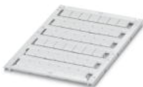
The figure shows an unlabeled version in white

Marker for terminal blocks, can be ordered: by sheet, violet, labeled according to customer specifications, Mounting type: Snap into tall marker groove, for terminal block width: 8.2 mm, Lettering field: 7.6 x 10.5 mm