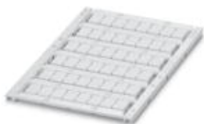
The figure shows the unlabeled version

Marker for terminal blocks, can be ordered: by sheet, white, labeled according to customer specifications, Mounting type: Snap into tall marker groove, for terminal block width: 7.62 mm, Lettering field: 7 x 10.5 mm