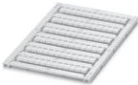
The figure shows the UCT-TMF 5 version

UniCard materials for thermal transfer printers, for labeling Weidmüller, Conta Clip, and Klemsan terminal blocks with horizontal marker groove, 72-section, can be labeled with THERMOMARK CARD and BLUEMARK LED, color: white