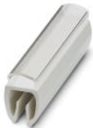
Conductor marker carrier, transparent, unlabeled, Mounting type: clip on, Cable diameter: 2-3.5 mm, Lettering field: 4 x 30 mm

Please be informed that the data shown in this PDF Document is generated from our Online Catalog. Please find the complete data in the user's documentation. Our General Terms of Use for Downloads are valid ( http://phoenixcontact.com/download )